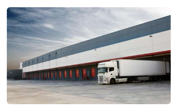
Transforming Logistics Operations Through Driving Behavior for Efficiency and Safety