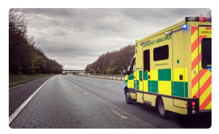
Emergency Fleet Maintenance Made Easy with Automated Reminders