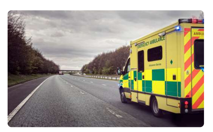
Emergency Fleet Maintenance Made Easy with Automated Reminders