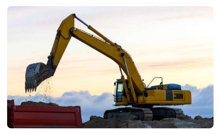
Optimizing Construction Fleet Maintenance with Reminder Software