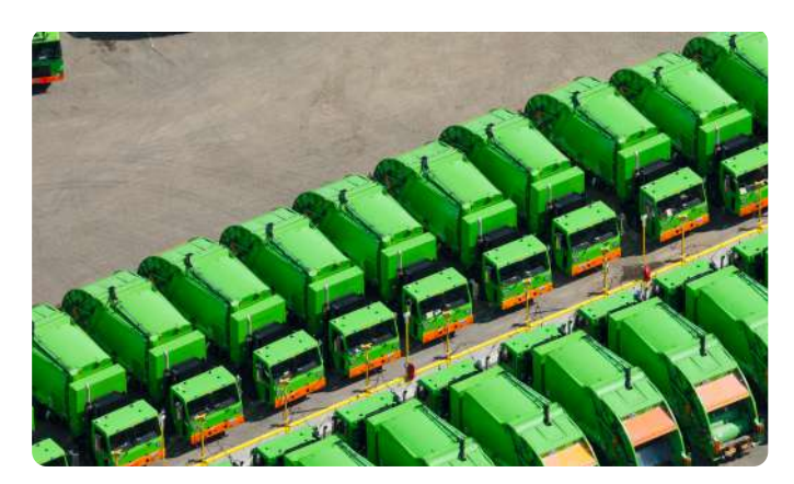
Efficient Waste Collection with Load Monitoring