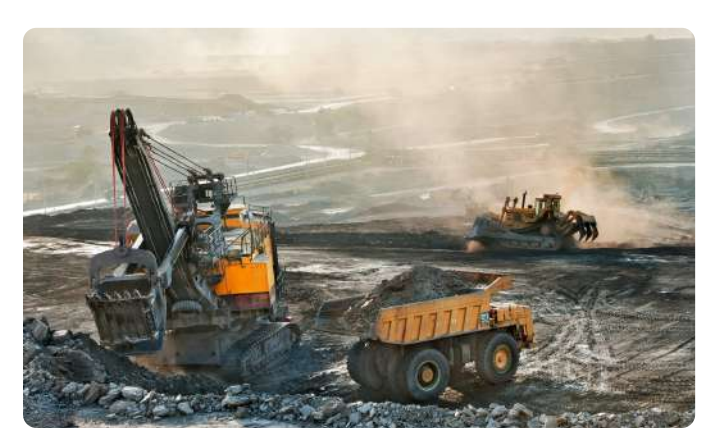
Keeping Construction Sites Safe with Load Monitoring Technology