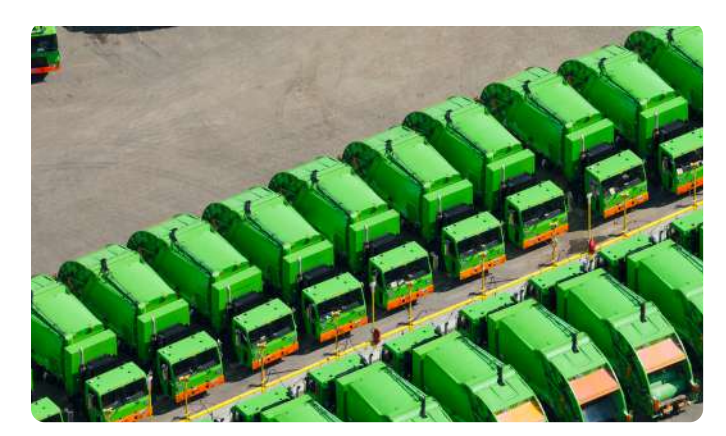
Streamlining Waste Collection Operations with Job Management