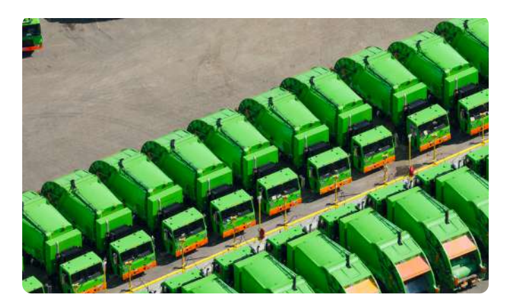
Streamlining Waste Collection Operations with Job Management