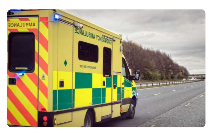
Streamlining Patient Care with Job Module for Mobile Medical Units