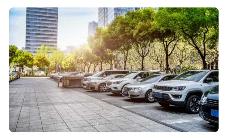
Revolutionizing Rental Fleet Expense Tracking