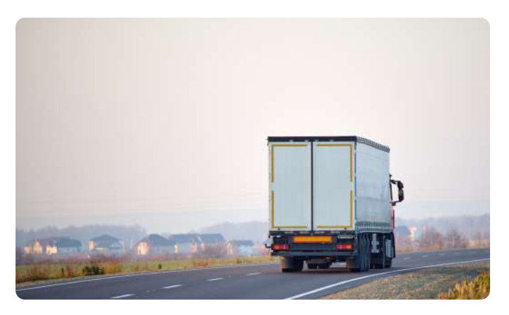
Enhancing Cargo and Shipment Security with E-lock