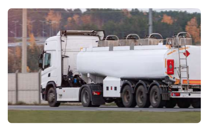
Safe Transportation of Hazardous Chemicals with TPMS