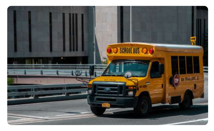
School Bus Safety with Video Telematics