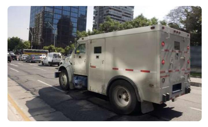
Securing Cash Carry Vans with Video Telematics